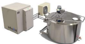
Solar Bulk Milk Cooler