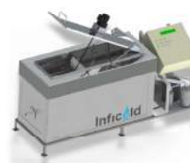
Solar 150L Milk Cooler