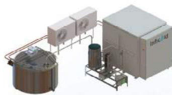
Solar Instant Milk Chiller